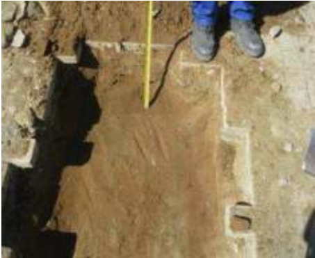
Fig 3: One of the test pits for Petrusville (Koppie Street)

In 2015 visual inspection along the road indicated that no discernable distress of the pavement occurred in the form of surface and base failures. Results in the next section clearly outlines that the sub-base is still in a sound condition and has not suffered from shear deformation through vehicle loads. This is also an indication that the drainage on all the roads was sufficient were properly constructed.