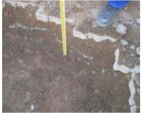
Fig 4: One of the test pits for Philipstown (Street 2)