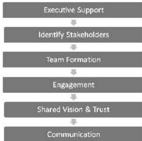
Figure 3.2.: Elements for developing a business continuity culture

The figure below indicates the elements necessary to build a culture that supports the organisation's business continuity philosophy and business continuity plan.