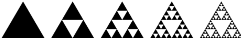
Figure 2. Iterations of the Sierpinski gasket.

The coupling between the tag and reader is dependent on their antenna structures, as these determine the shape and other attributes of the radiated or captured fields. Fractal antennas are an active area of research. Fractals are objects or quantities that display self-similarity (Weisstein 1999). Figure 2 shows an example of a fractal structure that is constructed iteratively.