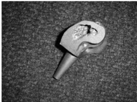
Figure 5: Laser sintered Titanium elbow implant (EOS)

mould for silicon injection. In a case study performed the machining of a Titanium elbow implant with 5-axis machining took a lengthy 104 hrs (Truscott et al., 2007). Furthermore, the 5-axis CNC machine is unable to machine internal structures. However, using LS technology for the same data set the building time for the Titanium elbow implant was only 11,5 hours. In addition the intricate internal bone geometry could be sintered.