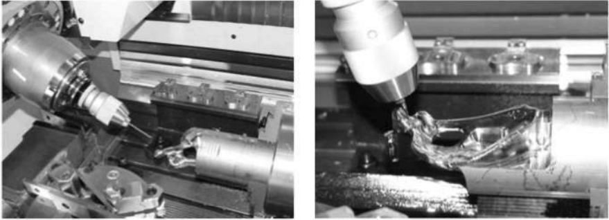
Figure 2: 5-Axis CNC machining of Titanium scapula (ISIQU)