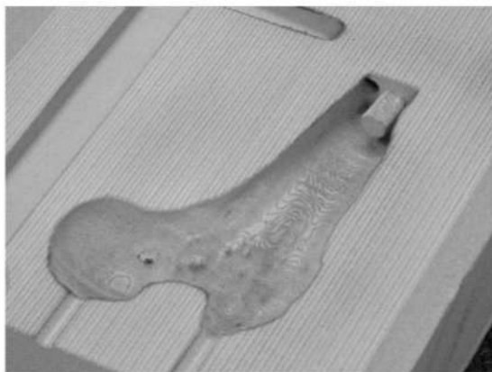
Figure 6: Sand mould grown on EOS S700

The LS process is regarded currently as leading the way for RM applications, although SLA is still used more specifically for medical and dental applications (Park, 2006). The problem, however, is that SLA materials can only be used as a preoperative model and not as an implant. Amethyst (2005) suggests that a more effective route for the medical industry would be to use the CT