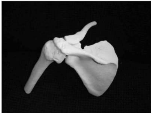
Figure 4: Laser sintered Nylon Polyamide prototype of scapula

parts with a 5-axis CNC machine in Titanium. The production of the planning models however still remains costly.