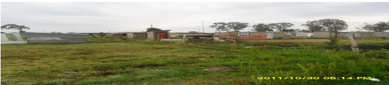
Figure 4.5: Shack houses at The Oaks village in Limpopo Province

Figure 4.5 represents shack houses at The Oaks village in Limpopo Province.