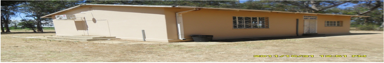
Figure 4.3: Basson telecentre in the farm at The Oaks - Limpopo Province

Figure 4.3 represents Basson telecentre in the farm at The Oaks.