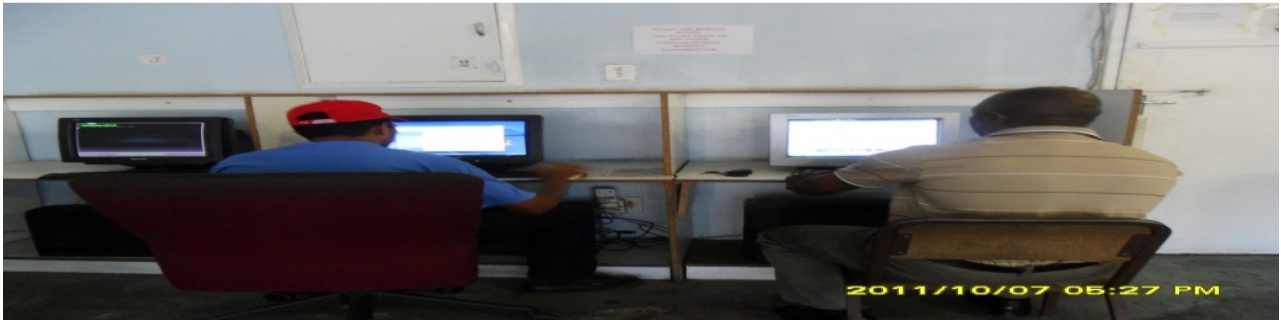
Figure 4.1: Mabaso Shop – Heuningvlei

Figure 4.1 represents the people from Heuningvlei using the computers at Mabaso shop.