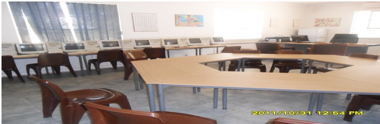
Figure 4.6: Computers inside Gaseleka telecentre in Limpopo Province

Figure 4.6 represents the computers inside Gaseleka telecentre in Limpopo Province.