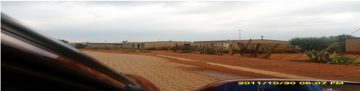
Figure 4.4: RDP houses at The Oaks village in Limpopo Province

Figure 4.4 represents RDP houses at the Oaks village in Limpopo Province.