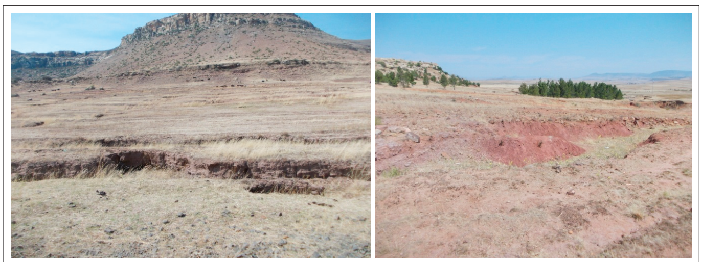
Source: Belle, J.A. & Hlalele, M.B., 2015, 'Vulnerability assessment of agricultural drought hazard: A case of Kotise-phola community council, Thabana Morena, Mafeteng district in Lesotho', Geography & Natural Disasters 5(2), 1-6.

The high unemployment situation in this area has resulted in some individual subsistence farmers such as Mr Matea at Ha Bofihla ploughing a cabbage field to earn a livelihood through small-scale cabbage selling. Figure 4 shows Mr Matea's cabbage field watered from a nearby water source. The human immunodeficiency virus and acquired immune deficiency syndrome (HIV and AIDS) are factors that have made this community more vulnerable to drought effects, where the elderly and the younger groups are left alone in homes for urban areas. HIV-infected individuals, the young and the