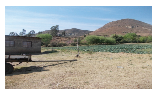
FIGURE 3: Abandoned community vegetable project at Ha Ngoae.