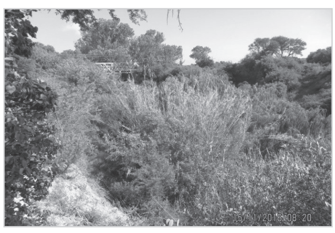
Figure 3. (left) shows a contemporary stereograph of the Koppies railway bridge. The caption reads: "The construction of an improvised bridge over the Rhenoster River, Orange Free State." The photograph of the railway bridge (Fig. 3, right) shows that the area is now dominated by exotic invaders.