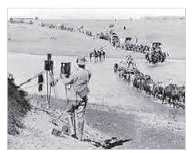
Figure 4. Stereographs of British forces, led by Lord Roberts crossing the Valsch river during the Anglo-Boer War. The captions read (left) "Lord Roberts rides into Kroonstad through the Valsch River" and (right) "Robert's ride into Kroonstad with his cameras poised to capture the occasion".