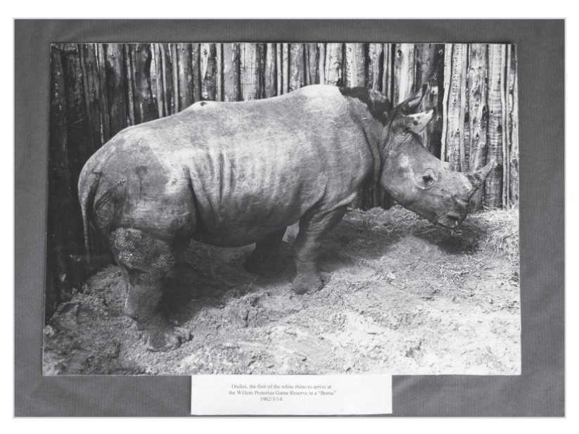
Figure 8. The white rhino Ondini before being released into the Willem Pretorius Game Reserve. The caption reads: "Ondini, the first of the white rhino to arrive at the Willem Pretorius Game Reserve in a boma 1962/3/14". This picture is currently hanging in an office at Willem Pretorius Game Reserve.

Willem Pretorius Game Reserve was established in 1956 by the provincial government as a replacement for the de-proclaimed Summerville Game Reserve. In 1962, this Reserve became the first in the Province to reintroduce white rhinos (Bourquin 1973). On 14 March 1962, the first white rhino, named Ondini (Figure 8), was relocated to the Reserve by the Natal Parks Board as part of their translocation program. In 1969, Dr J.G. van der Merwe was the first farmer in