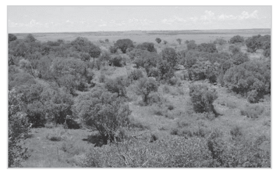
Figure 2. (Left) A picture taken of neighbouring farmers at Rhenosterkop in 1922/23. The caption reads: "RHENOSTERKOP PIC-NIC DEC 29<sup>TH</sup> 1922–JAY 2<sup>TH</sup> 1923". (Right) Photograph of approximately the same site taken in 2017.