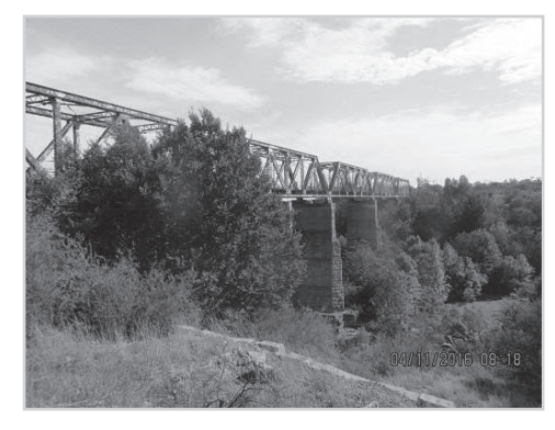
Figure 5. The railway bridge at Kroonstad (left) during the Anglo-Boer War and (right) in 2016.