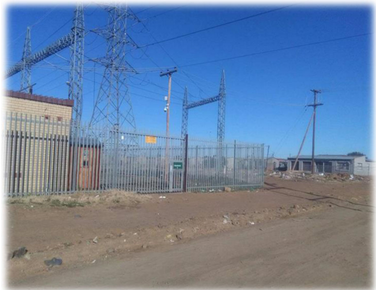
Fig. 2 BOS1 nearby residential properties

interims, measurements were collected at four different corners inside each selected distribution substation, near the barrier screening, and the distance was referred to as 0 m and indicated as a reference point. Measurements were also collected at the distances of 3 m, 6 m and 9 m, near every corner outside the substations. The meter was held at a height of 1 m above the ground level to ensure that any emissions from underground power lines do not affect the readings.