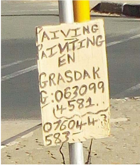
Figure 1: A casual worker's advertisement