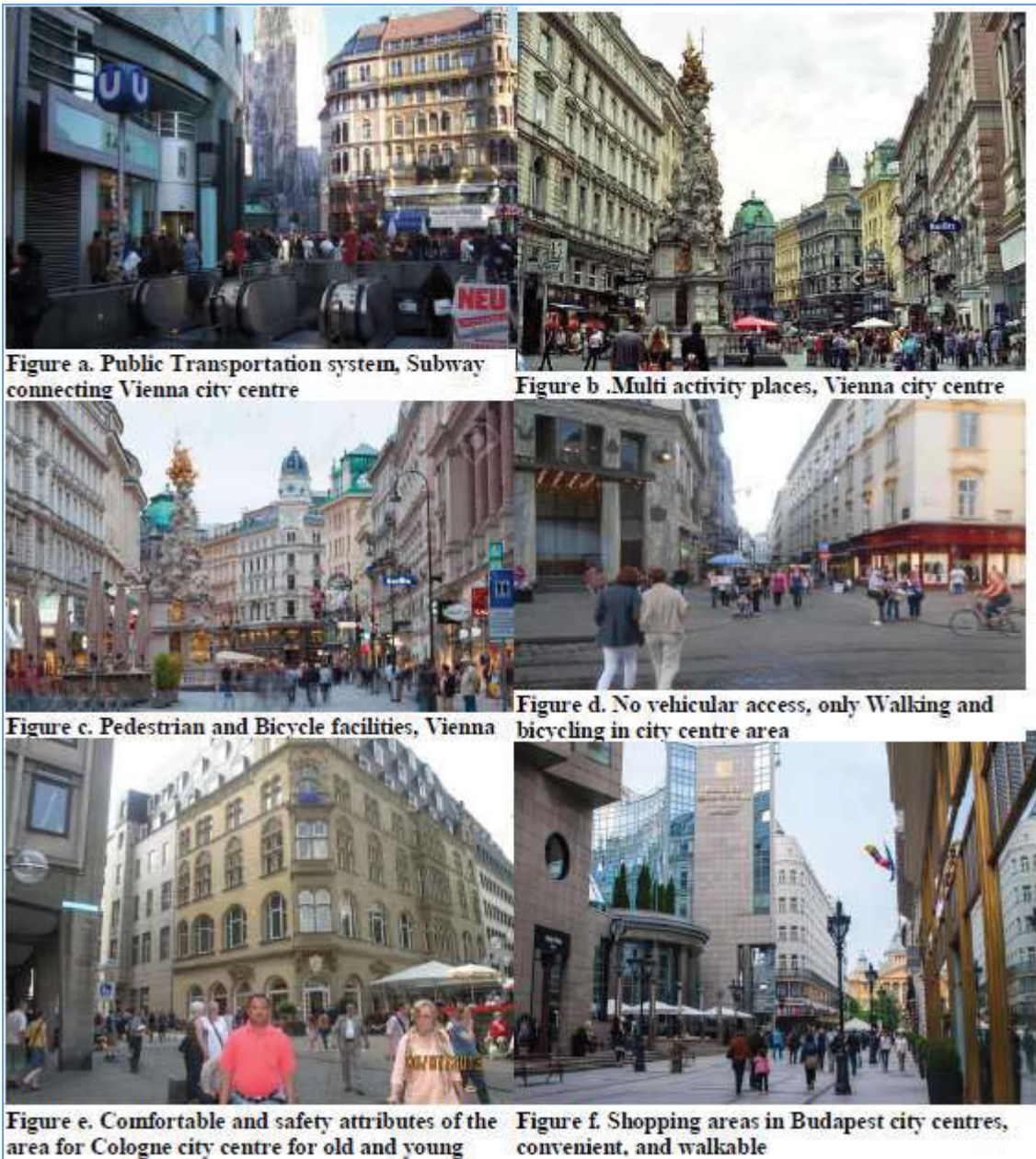
Figure 1. Photographs showing different attributes of Central areas of Selected European cities